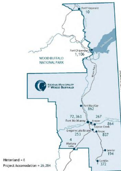
Figure 1 - Municipality of Wood Buffalo

Source: Municipality of Wood Buffalo (2008)